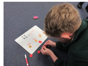
Division using practical methods